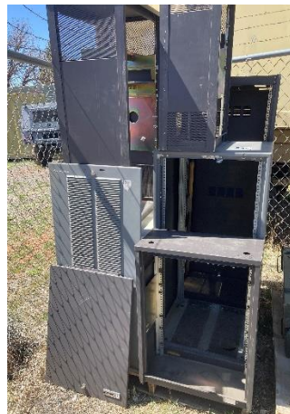
7 - RADIO RACKS