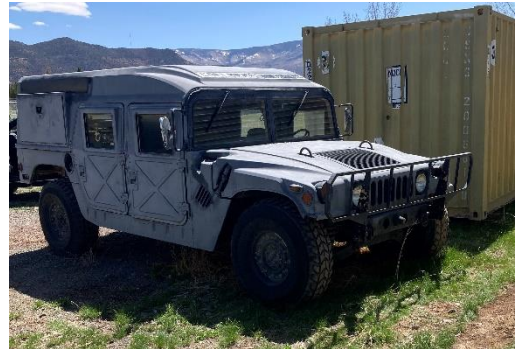
1991 AM GENERAL HIGH MOBILITY VEHICLE