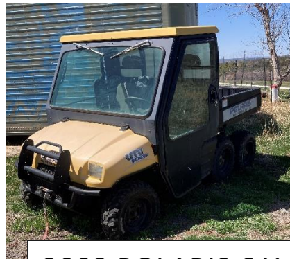
2003 POLARIS 6 X 6