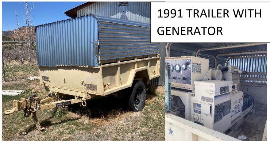
1991 TRAILER WITH GENERATOR