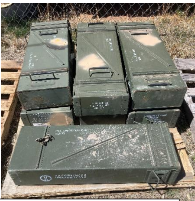
7 – GREEN METAL AMMO CANS