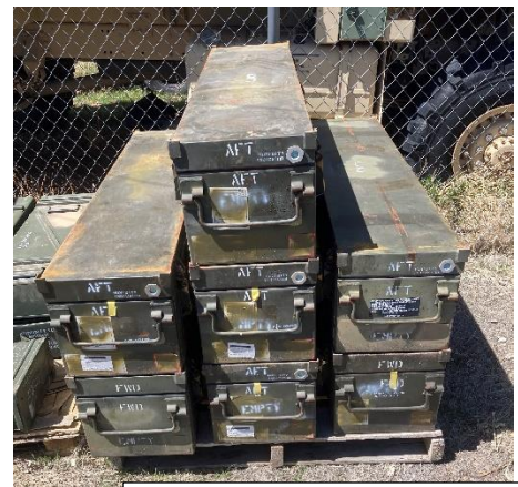
7 – GREEN METAL STORAGE BOXES