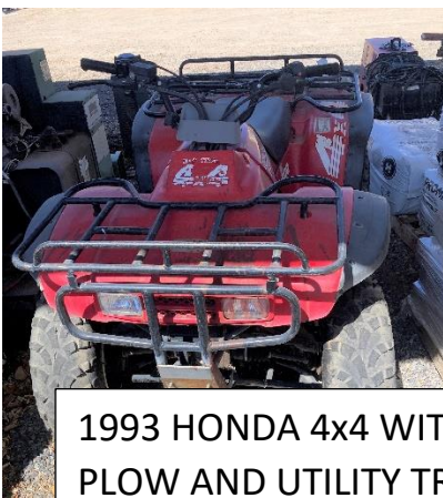
1993 HONDA 4x4 WITH PLOW AND UTILITY TRAILER