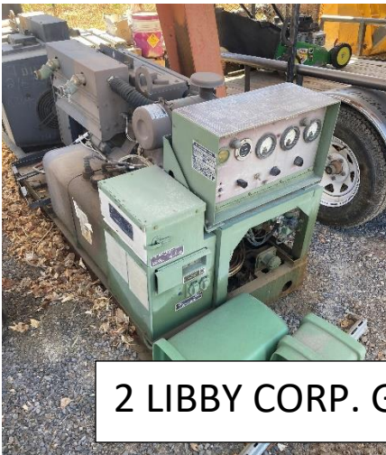
2 LIBBY CORP. GENERATORS