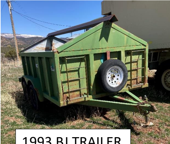
1993 BJ TRAILER