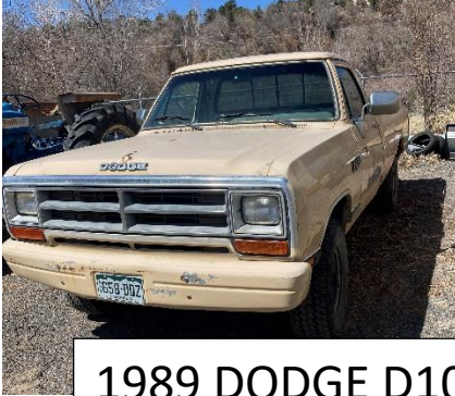
1989 DODGE D100 PICKUP