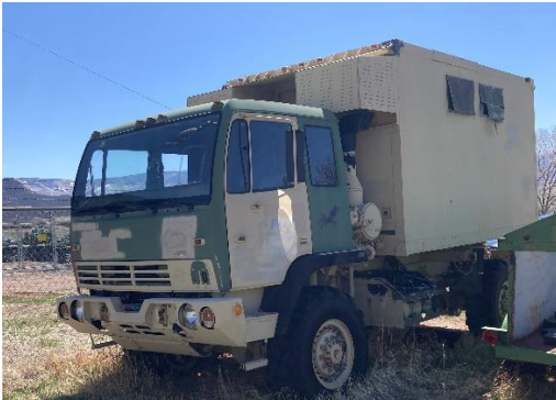
1999 STEWART & STEVENSON TRUCK